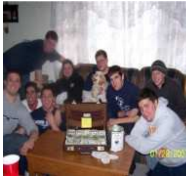
The Mifflinburg canning crew celebrate after a long weekend

With trips to Yardley, Mifflinburg, Wyomissing, Levittown and many other exotic locales, the brothers braved both cold weather and menacing traffic alike to raise money for children with cancer. For anyone who has never been canning in mid-winter, it can be brutally cold and sometimes discouraging.