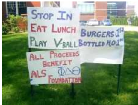
Creativity is key in business and fundraising – Great Job Guys!

The fraternity with the best property proved, once again, just how key its location on Penn State's campus really is. On Memorial Day weekend, Penn State welcomed over 300 volleyball teams to compete in the annual East Coast Volleyball Tournament. With a majority of the games being played right up the street at Rec Hall the Phi Delt house had many visitors walking by.