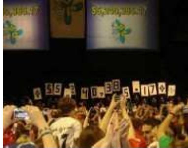
$5 million plus!!!