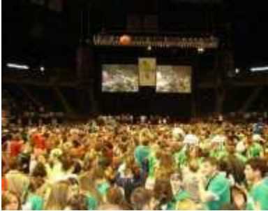
A view of the increased capacity of the BJC