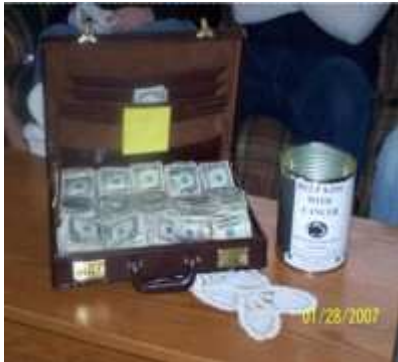
The briefcase of bills that put the actives over the top – topping last year's record

Brothers made time in their busy schedules to travel all over the state collecting money for the kids. This year, a new house rule determined that brothers who wished to dance had to earn their spots through fundraising and active participation. A little friendly competition certainly helped keep our fundraising efforts strong.